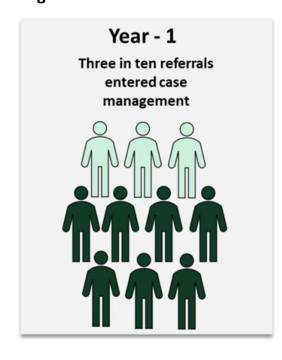
Figure 4: Referrals to Public Health Nurse case management

Starting Over, Inc. connected to RUHS-Behavioral Health crisis intervention services, which will allow staff to call mental health professionals in lieu of law enforcement when individuals are experiencing a mental health or substance use crisis. Decreasing the burden on law enforcement and increasing the potential for a successful outcome for the patient.